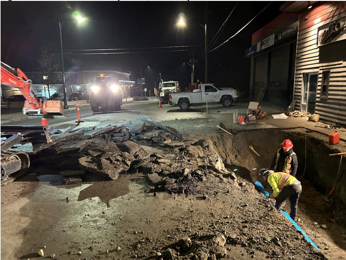
Figure 2 – Watermain break on Aster St.