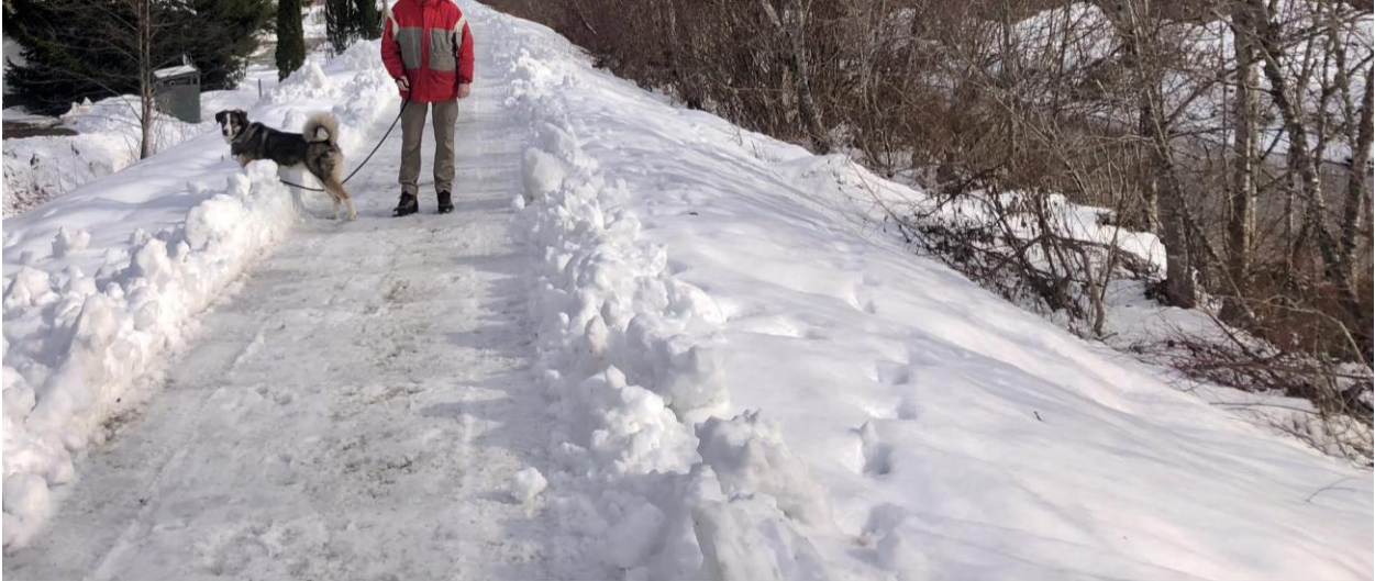
Figure 1 – Pemberton Creek Dyke trail, cleared by Public Works Crew