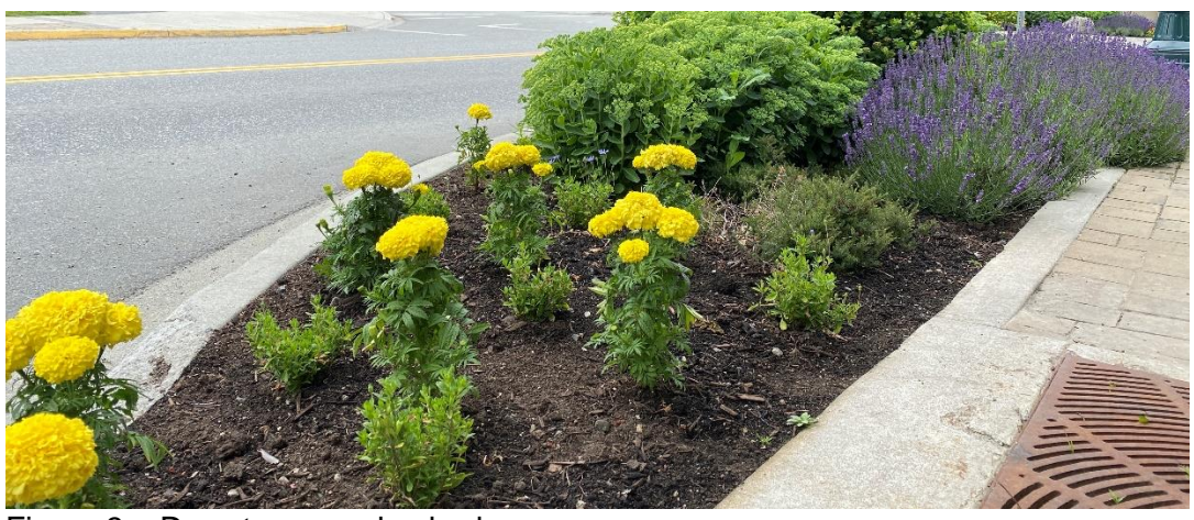
Figure 3 – Downtown garden beds