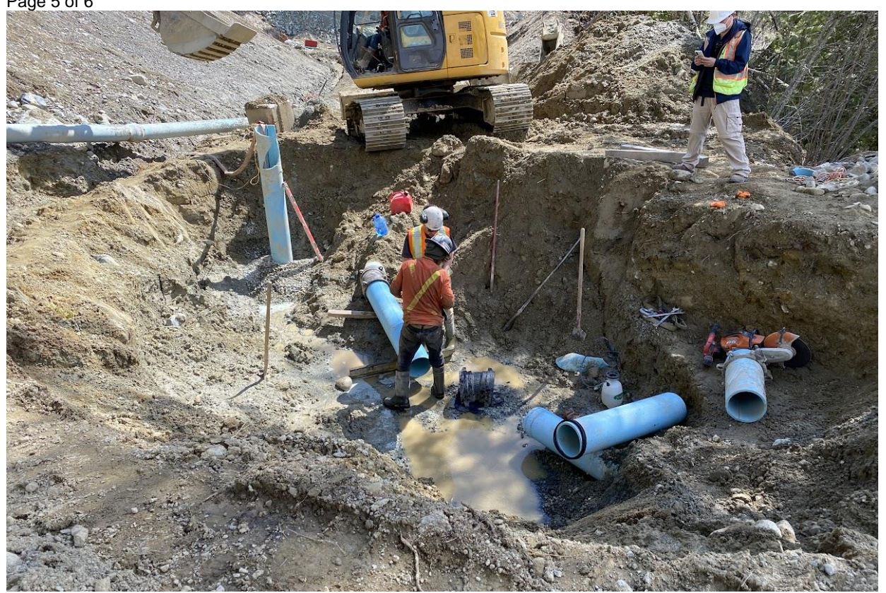
Figure 4 – Water main connection for Sunstone Phase 2