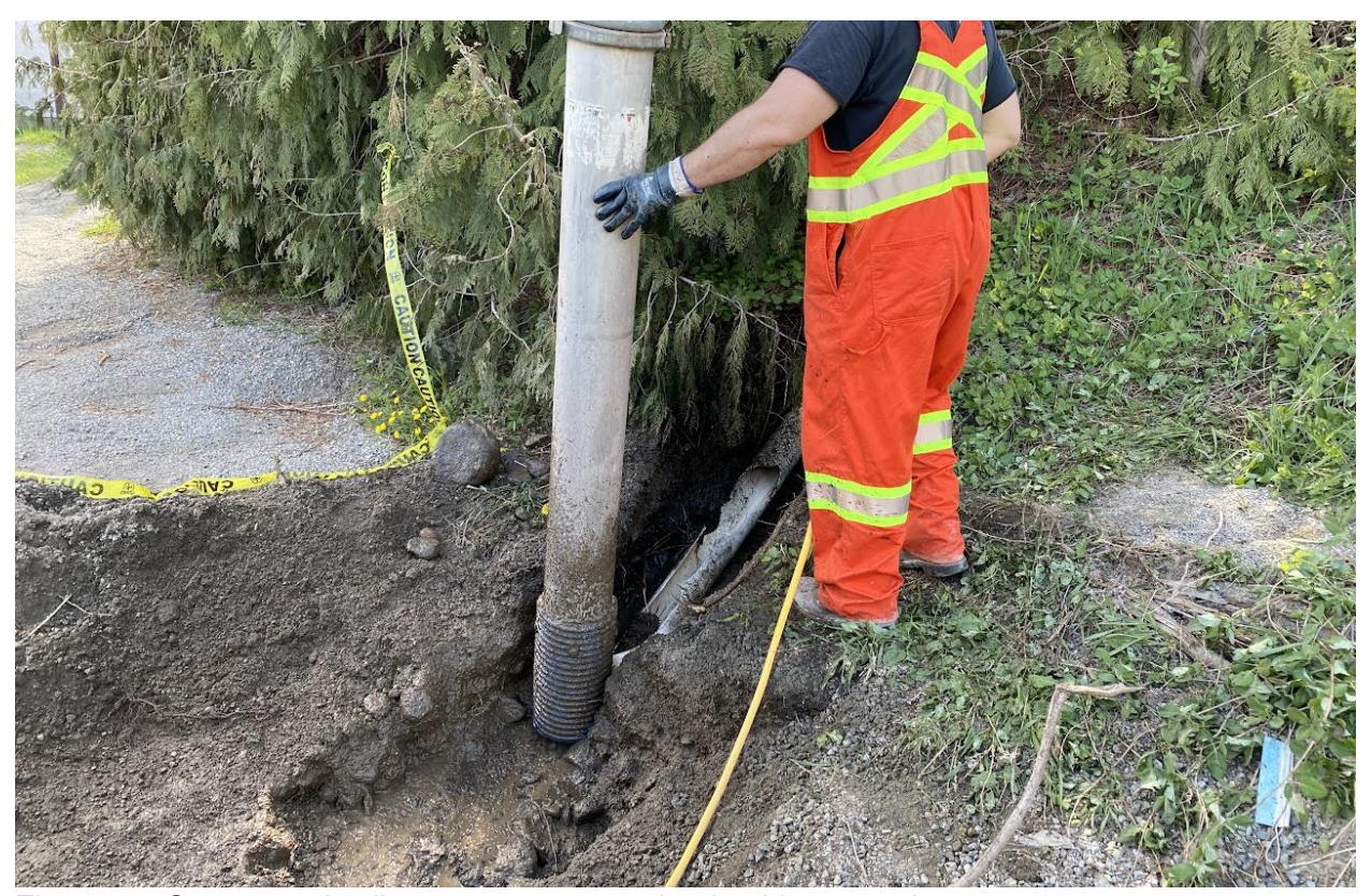
Figure 5 – Sewer service line emergency repair – beside general store