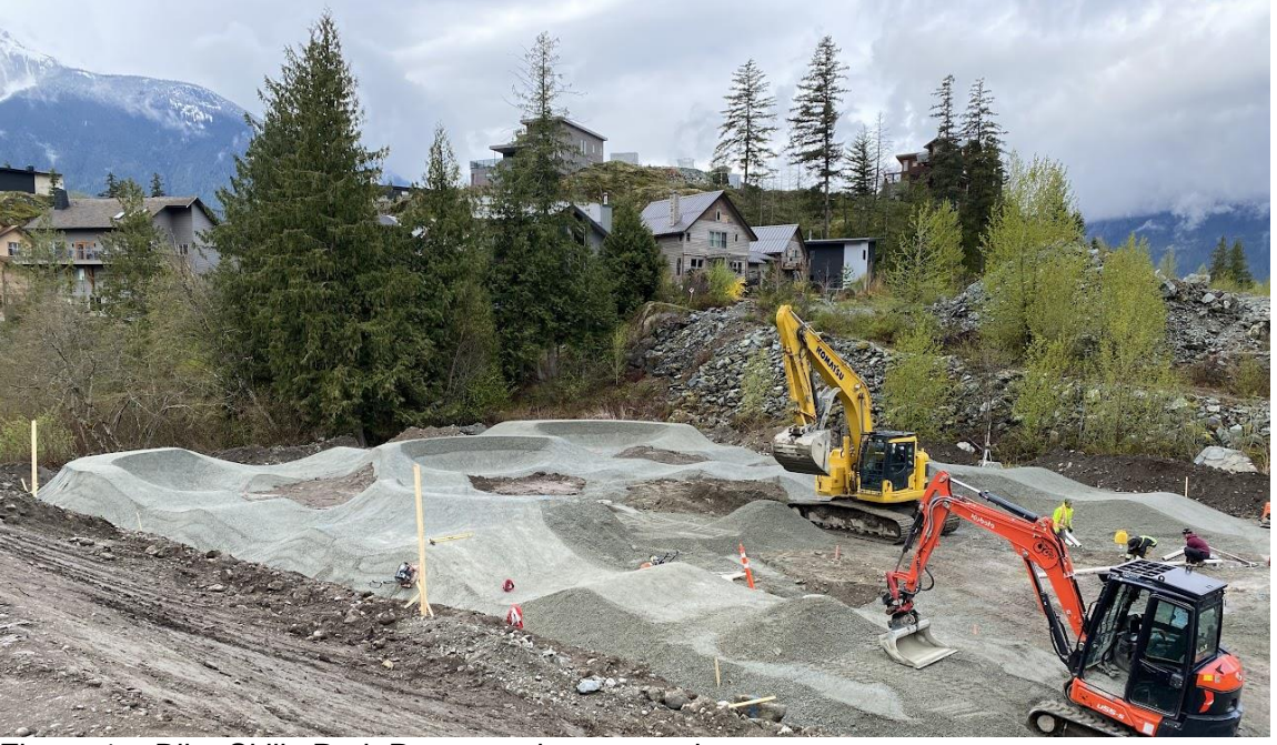
Figure 1 – Bike Skills Park Pump track construction