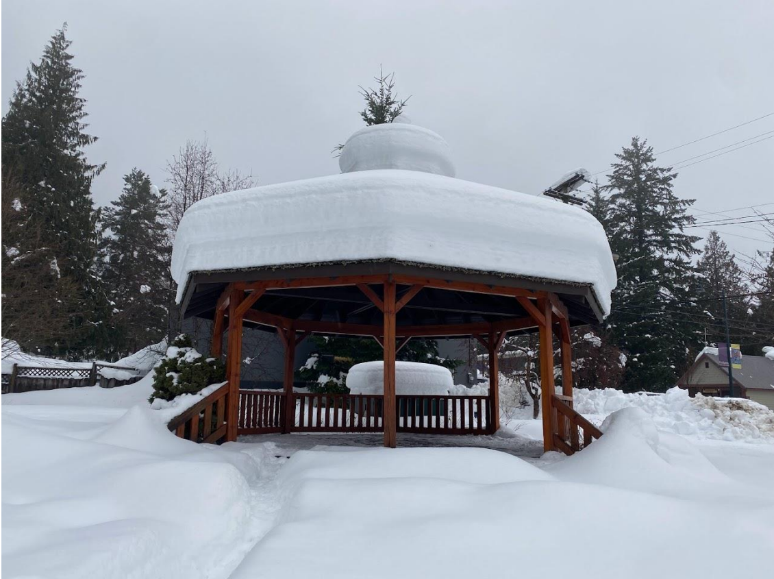
Figure 2 – Snow load on gazebo roof at Pioneer Park