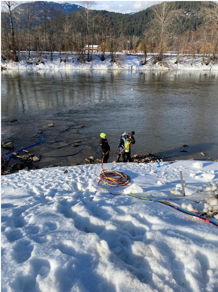
Figure 1 – Divers preparing underwater inspection of WWTP outfall

Below are photos of some of the activities that took place in the first quarter.