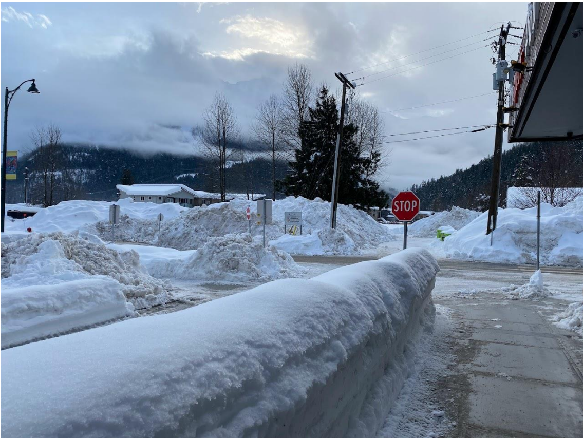
Figure 3 – Corner of Frontier and Aster snow piles (in front of Pemberton Hotel).