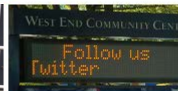
Automatic changeable copy signs