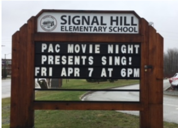
Manual changeable copy signs