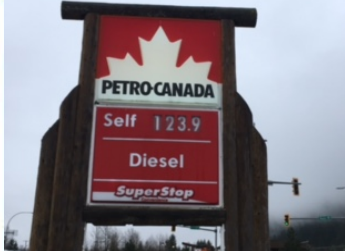
Free standing signs